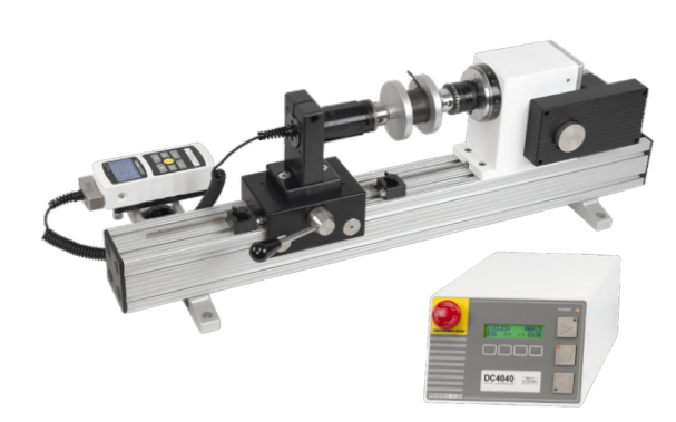
^ Model TSTMH-DC is shown in a torsion spring test, with a Series R50 torque sensor and M5i force/torque indicator